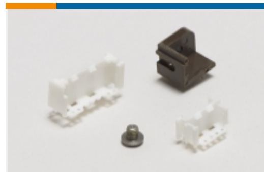
PCB Connector Mounting(2)