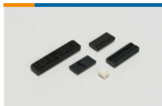
Wire-to-Board Connector Assemblies & Housings(157)